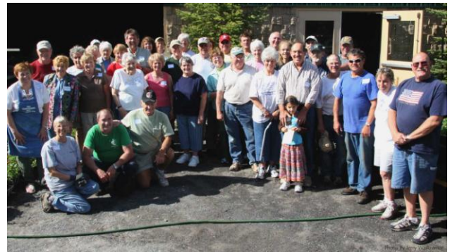
Flower Basket Potting Party June 2008*